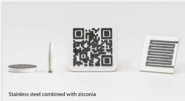
Stainless steel combined with zirconia

Two separate vats mean ceramics can be combined with other ceramics, polymers or metals. This technology can process any sinterable powder and the open material system makes it easy to develop customized materials and combinations thereof, opening the door to complete freedom in material design. Customers can specifically optimize parameters using open software technology.