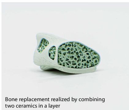
Bone replacement realized by combining two ceramics in a layer